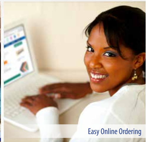
Easy Online Ordering