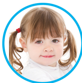
Frog Street Toddler (18-36 months)