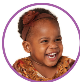
Frog Street Threes (36-48 months)