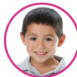
Frog Street Pre-K (48-60 months)

Infant • Toddler • Threes • Pre-K • Professional Learning •