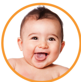
Frog Street Infant (0-18 months)